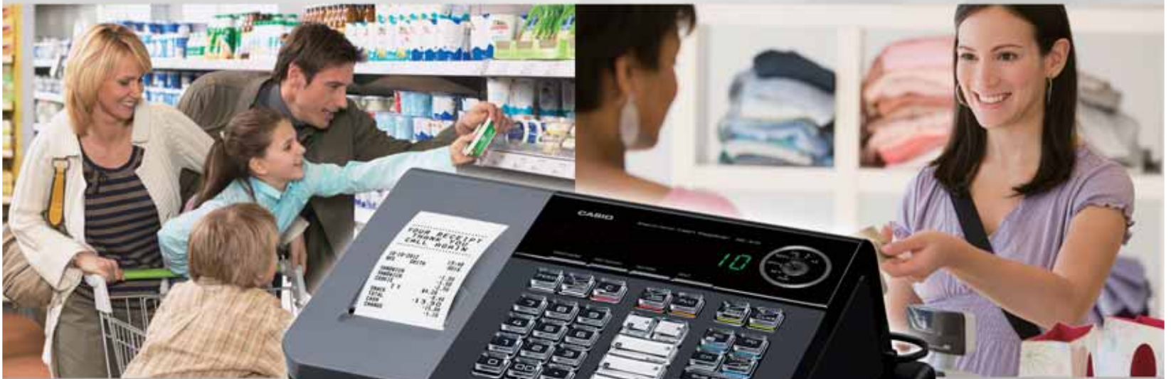
Small drawer model

The SE-S10 smart cash register combines convenience in setup and day-to-day operation with deluxe features such as a customer-friendly rear display and antimicrobial keyboard. This stylish, compact register suits any retail environment.